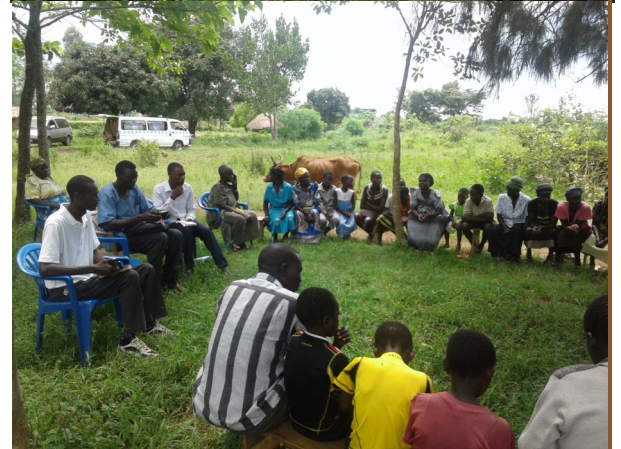
Below: Muddy roads used in South Sudan. Upper rt: Bush "roads" to reach people group in S. Sudan. Right: Bible Story Telling in Uganda